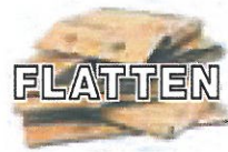
Cardboard (place inside or next to cart)