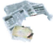
Newspaper, inserts, office paper, and junk mail