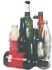
Glass jars & bottles