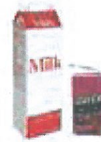
Milk, juice boxes, juice cartons