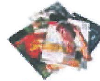
Magazines & catalogs