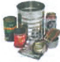
Aluminum, tin and steel cans, containers and foil