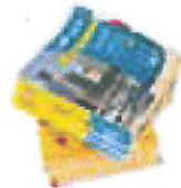
Phone books and paperbacks