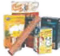
Cereal boxes and other paperboard boxes